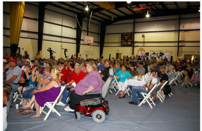
Another packed house!