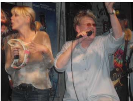
How cool is this!