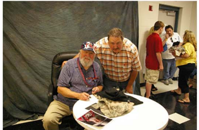
Mark Donaldson with Charlie