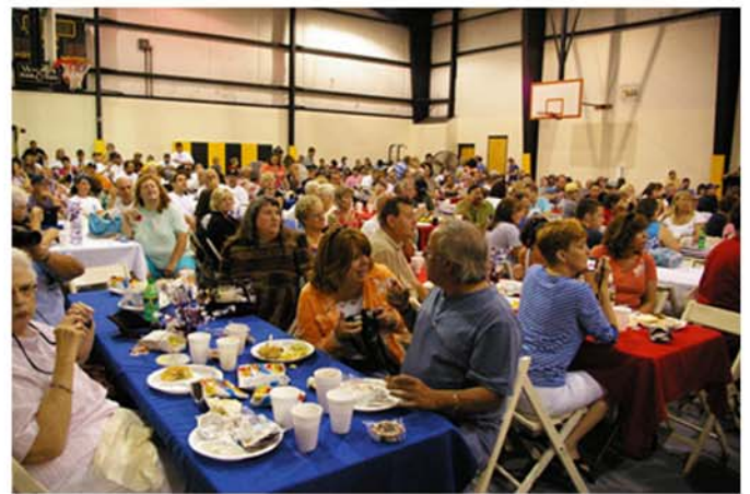
Another packed house